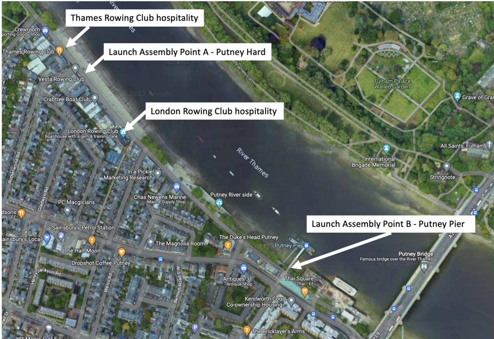
Map of assembly points: