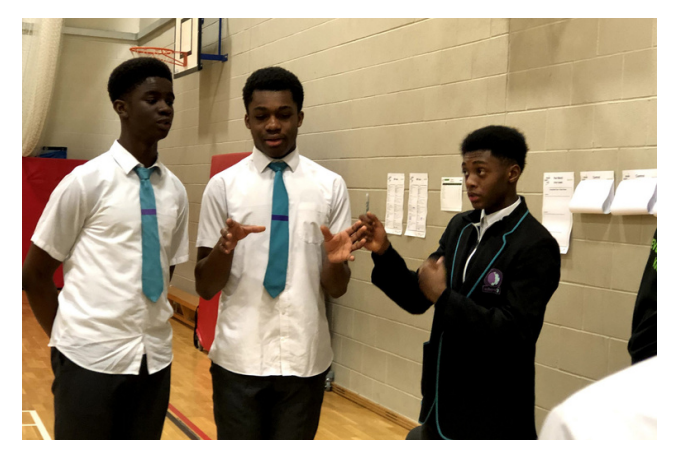
BEHIND EVERY KICK

This is an ambitious initiative, and we seek to work with transformative organisations able to deliver life changing experiences through sport. Through collaboration with grassroots engagement experts this initiative aims to give young people access to a sport they may not have had the opportunity to find before. We will work with organisations who utilise rowing machines as well as rowing boats and whose ambitions for young people go beyond sport.