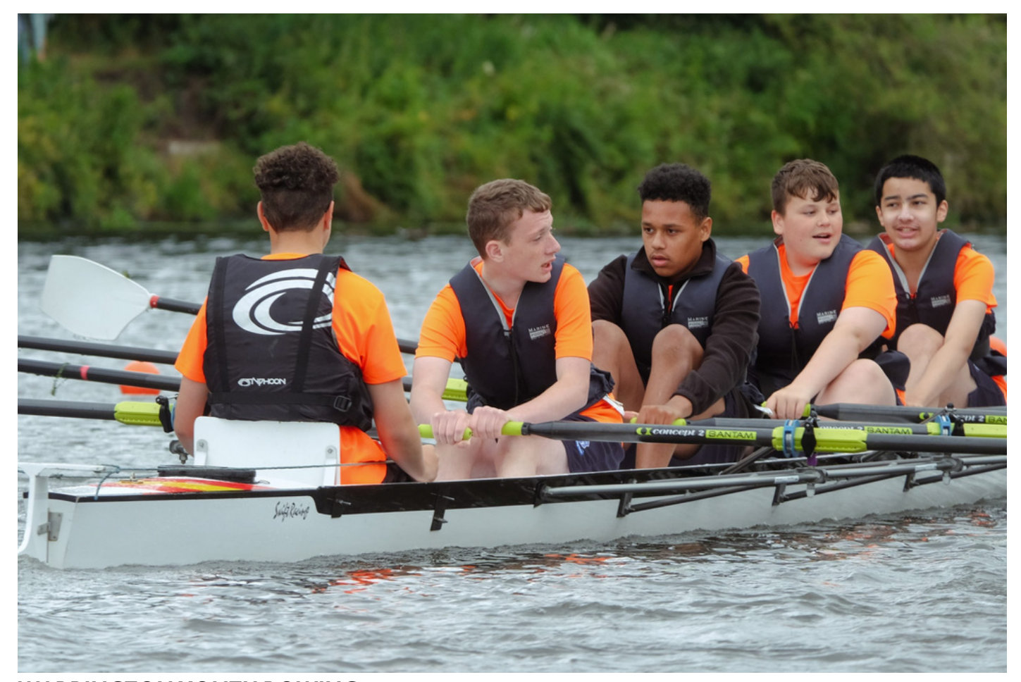
WARRINGTON YOUTH ROWING