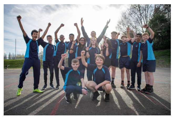
LONDON YOUTH ROWING - LEEDS